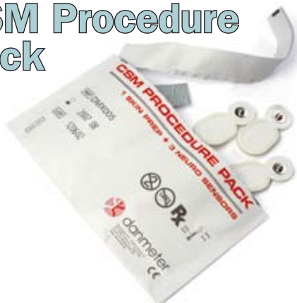
1 X SKIN PREP