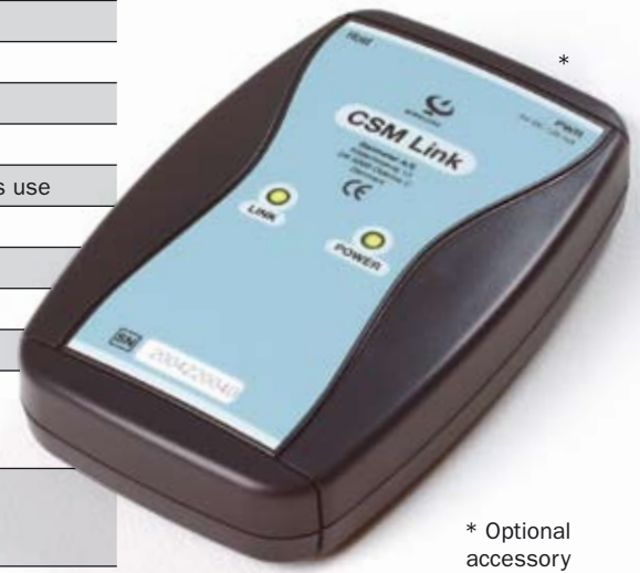
* Optional accessory